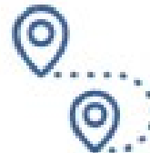
QUALITY OF LIFE